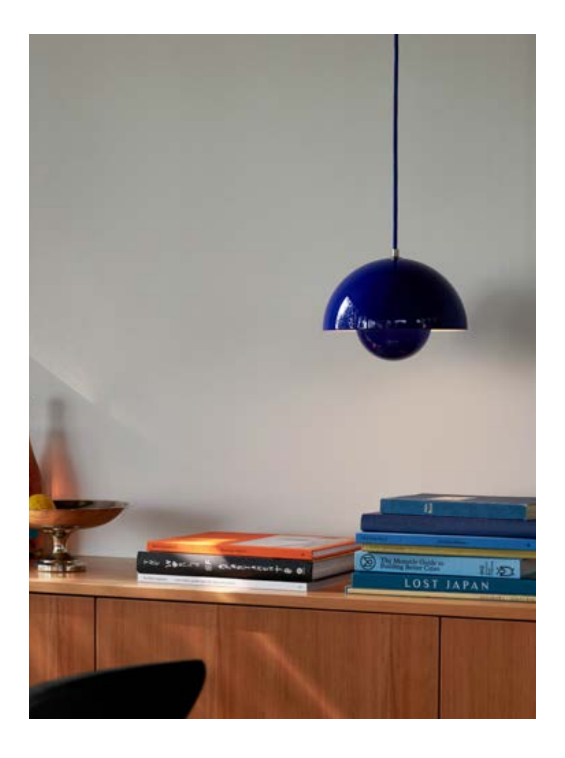
Press Release Flowerpot & Topan Verner Panton