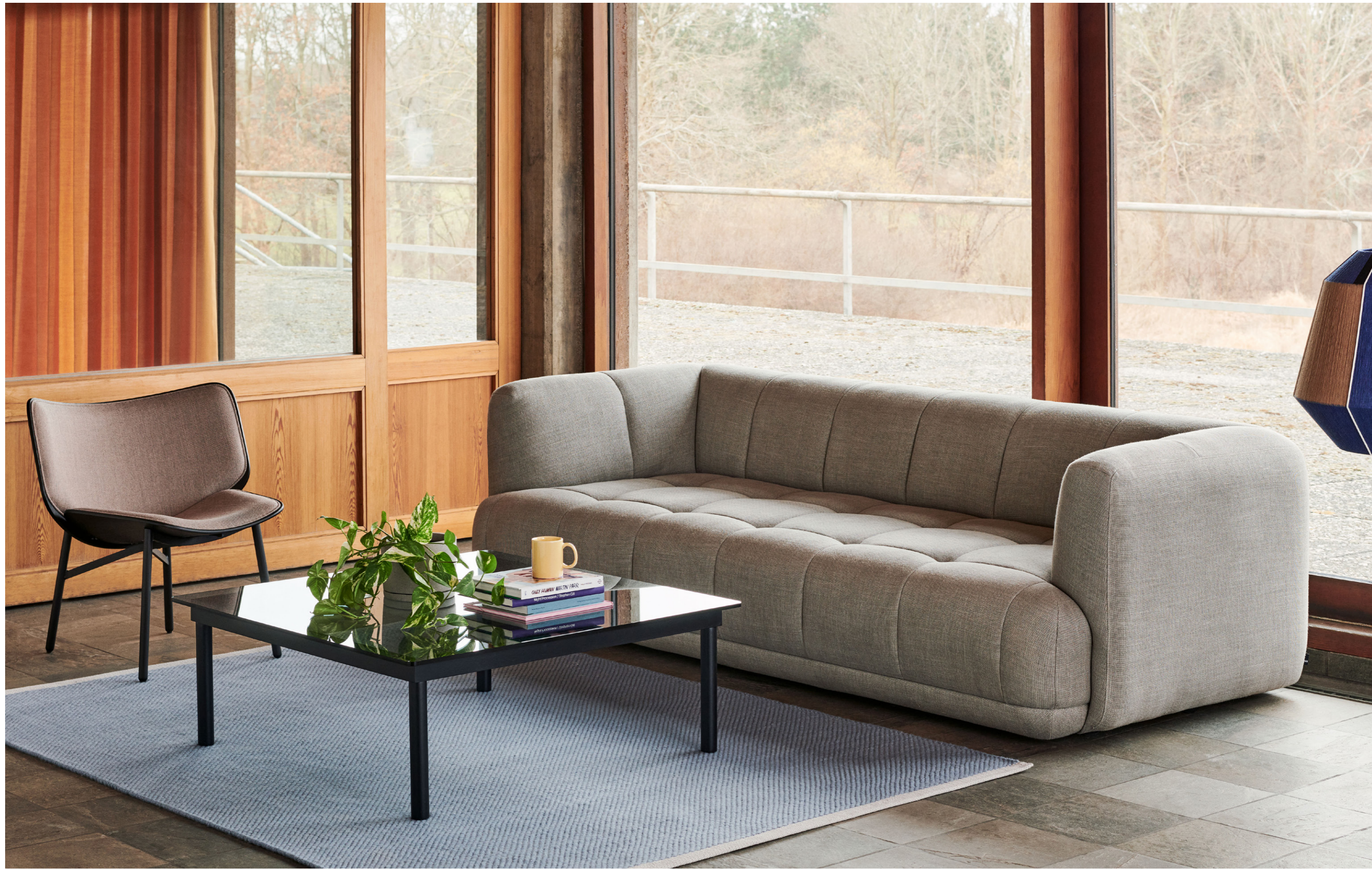
Quilton 3 Seater, Linen Grid Adriatic blue Dapper, Re-Wool 628