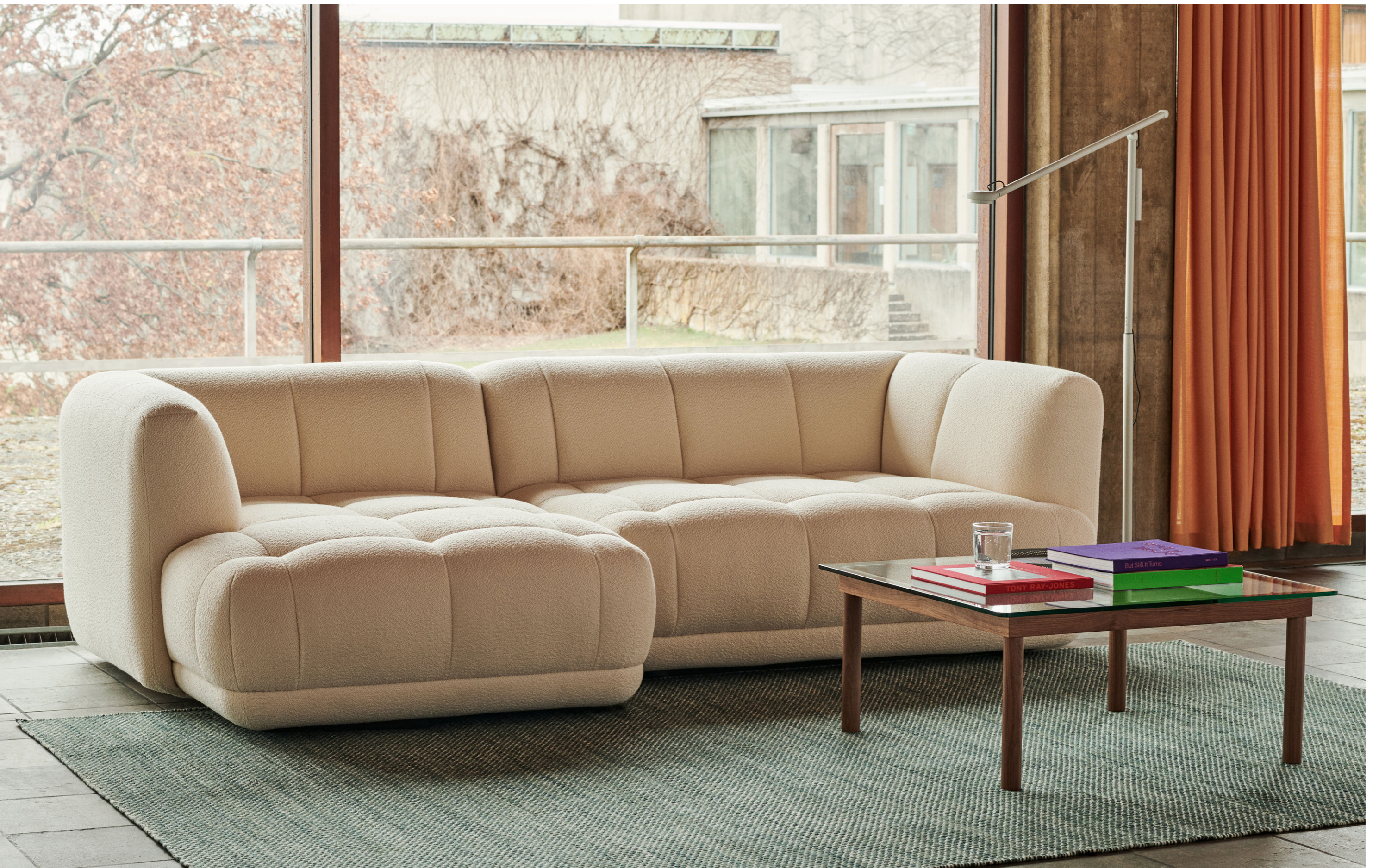
Quilton Combination 19 Left, Flamiber Cream A5