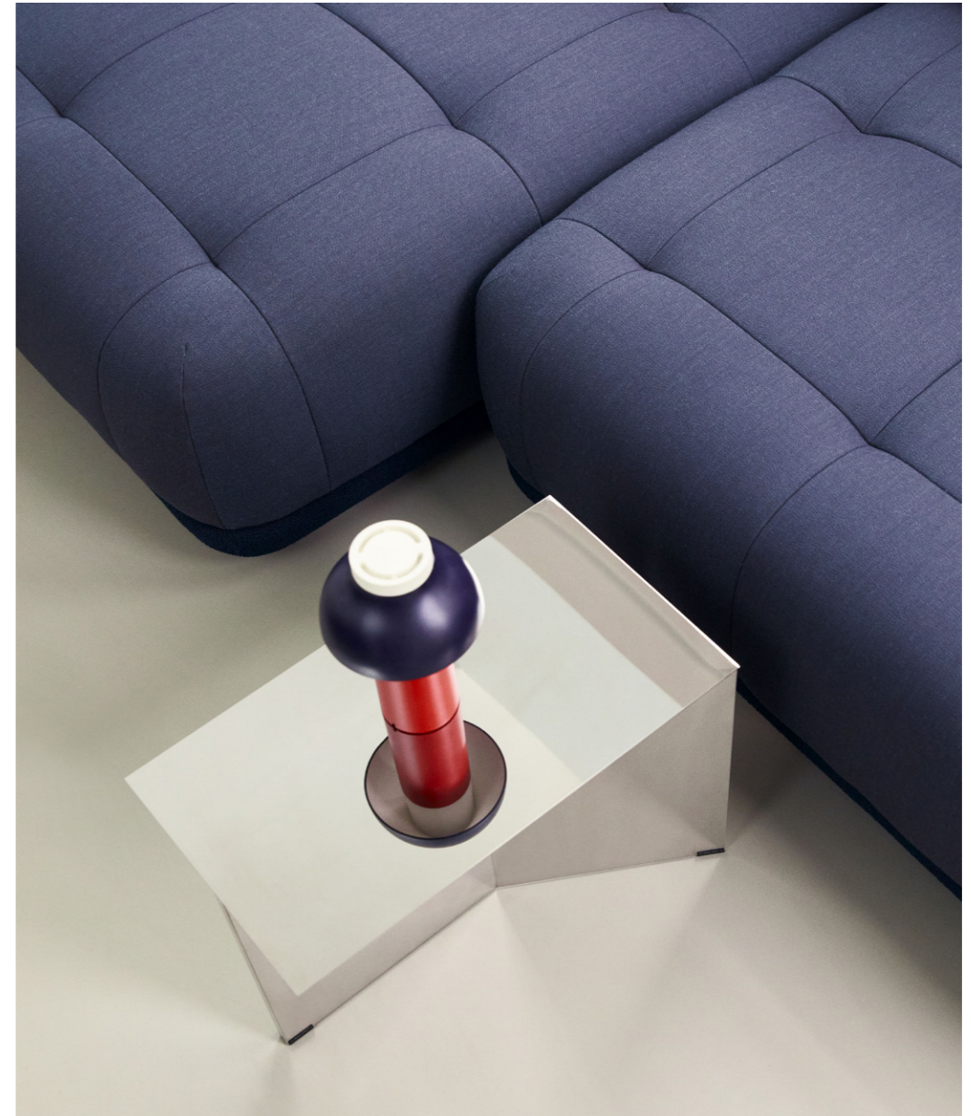
Quilton Duo, front Atlas 881, back & base Flamiber Dark blue J4