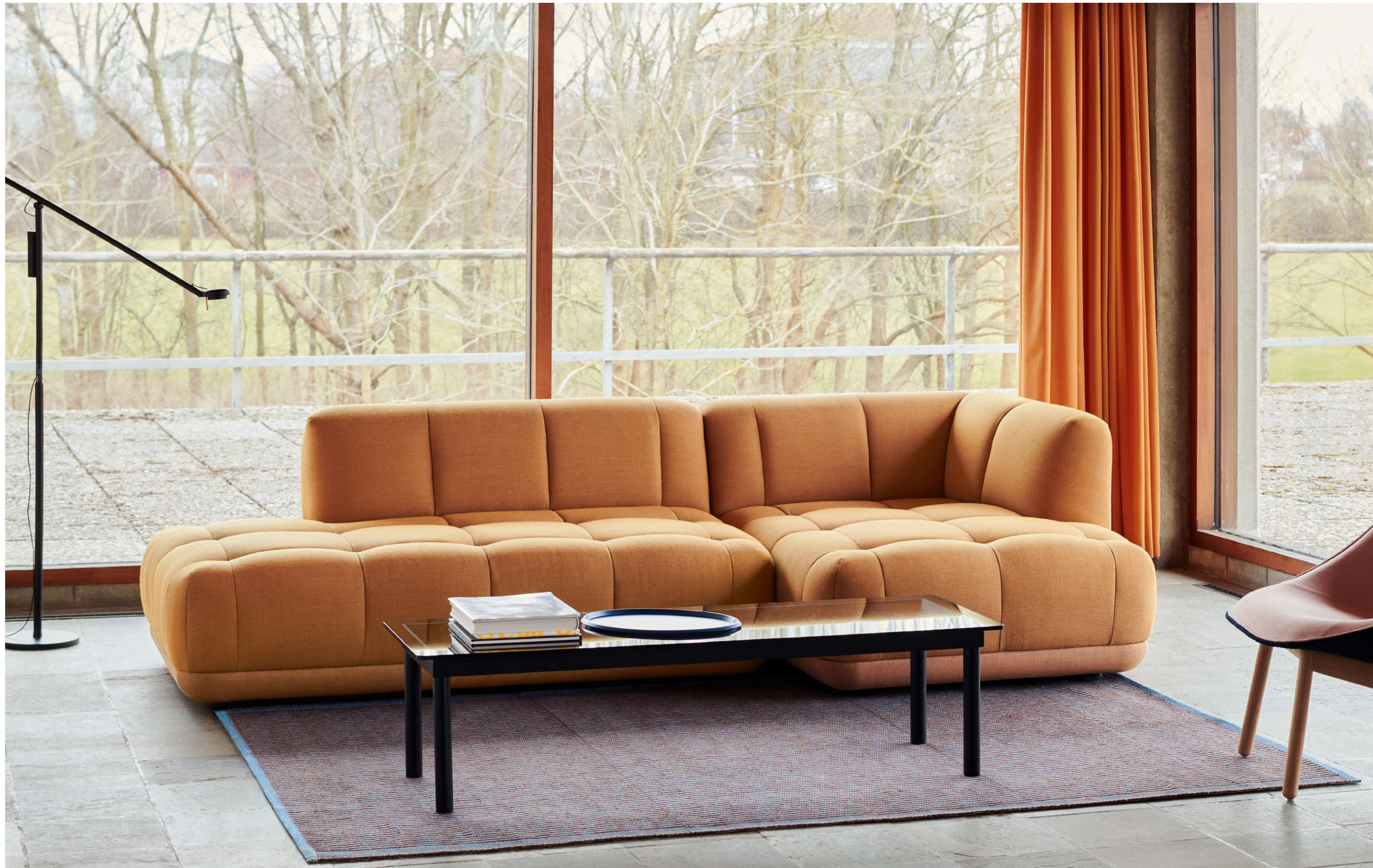
Quilton Duo Combination 21 Right, front Fiord 442, back & base Remix 252