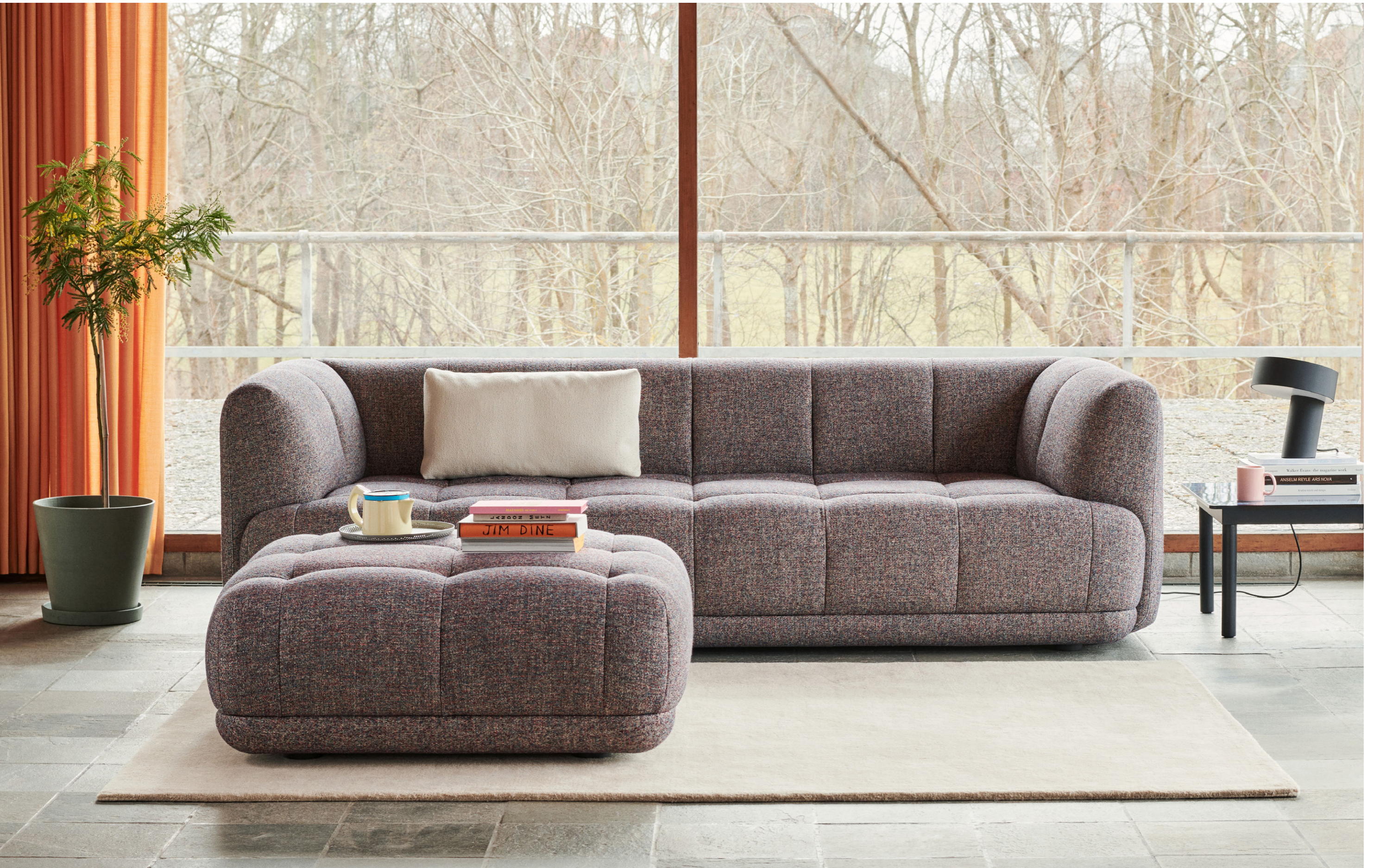
Quilton 3 Seater & Ottoman, Swarm Multi colour