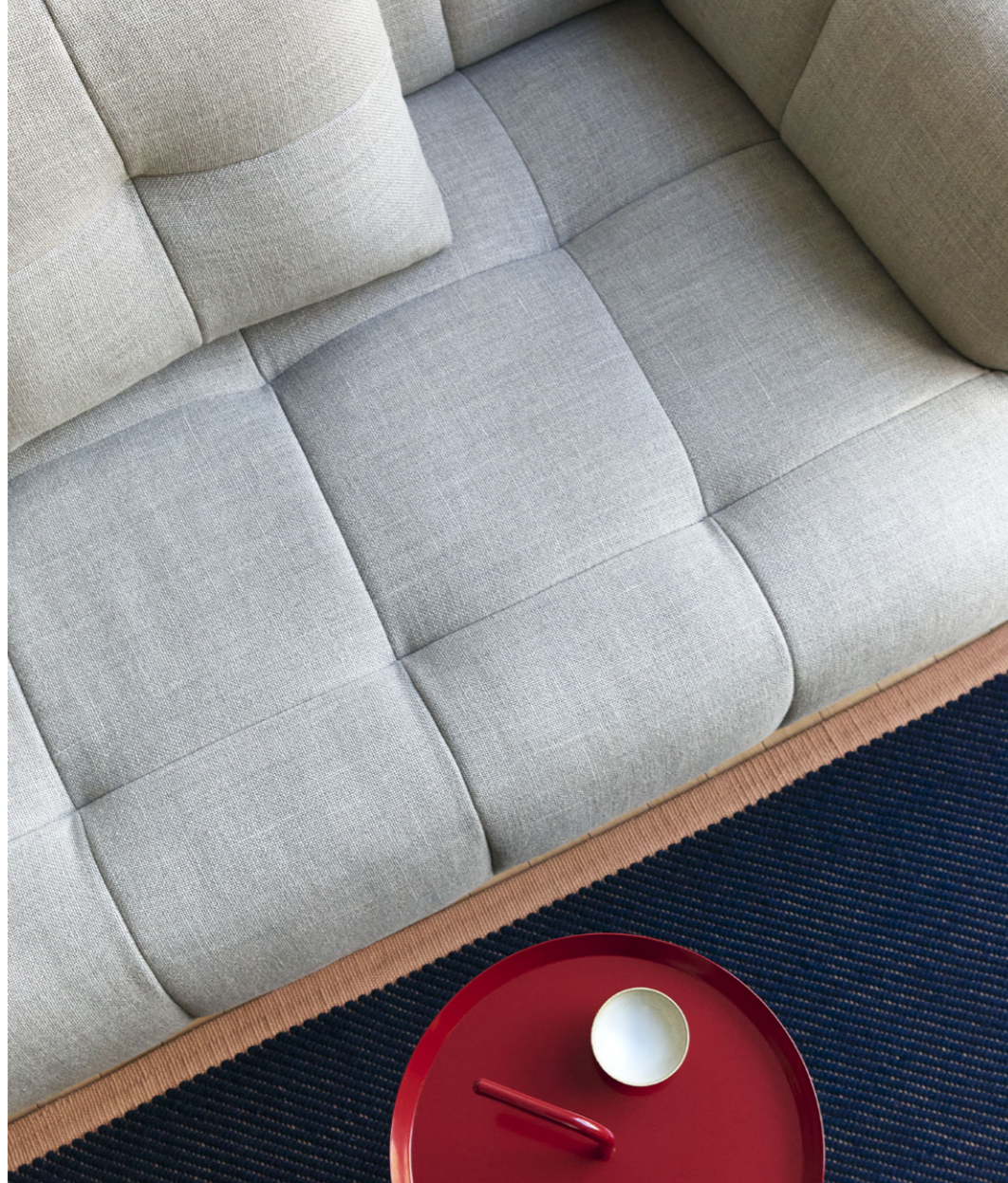
Quilton, Linen Grid Adriatic blue